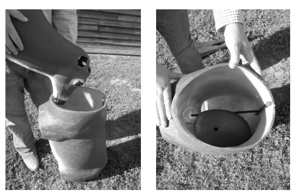
Step 2 Insert head on right side of frame post.