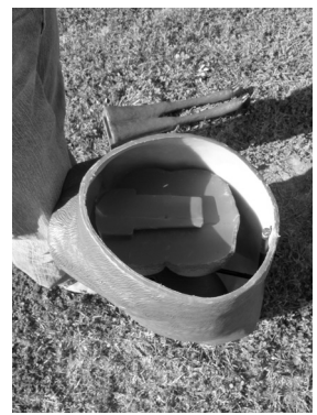
Step 3 Insert back legs on left side of frame post, hooves first.