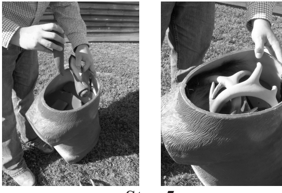
Step 5 Insert ears, antlers and tail.

For easy carry, place the stored decoy in the carrying bag provided.