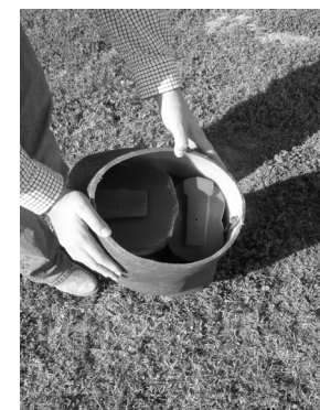
Step 4 Insert front legs along the backbone, hooves first. The front legs should straddle frame post.