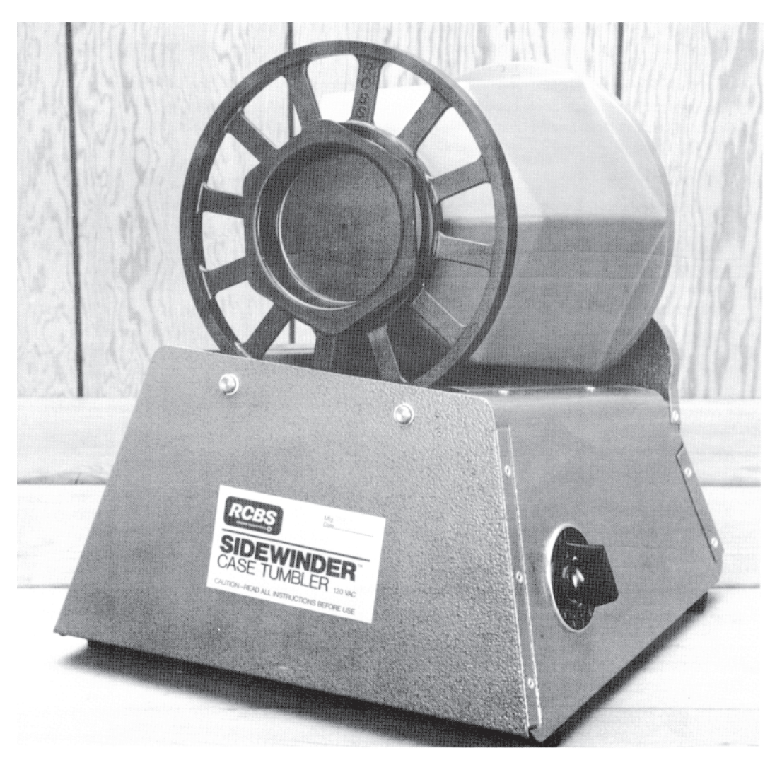
Safety and Operating Instructions